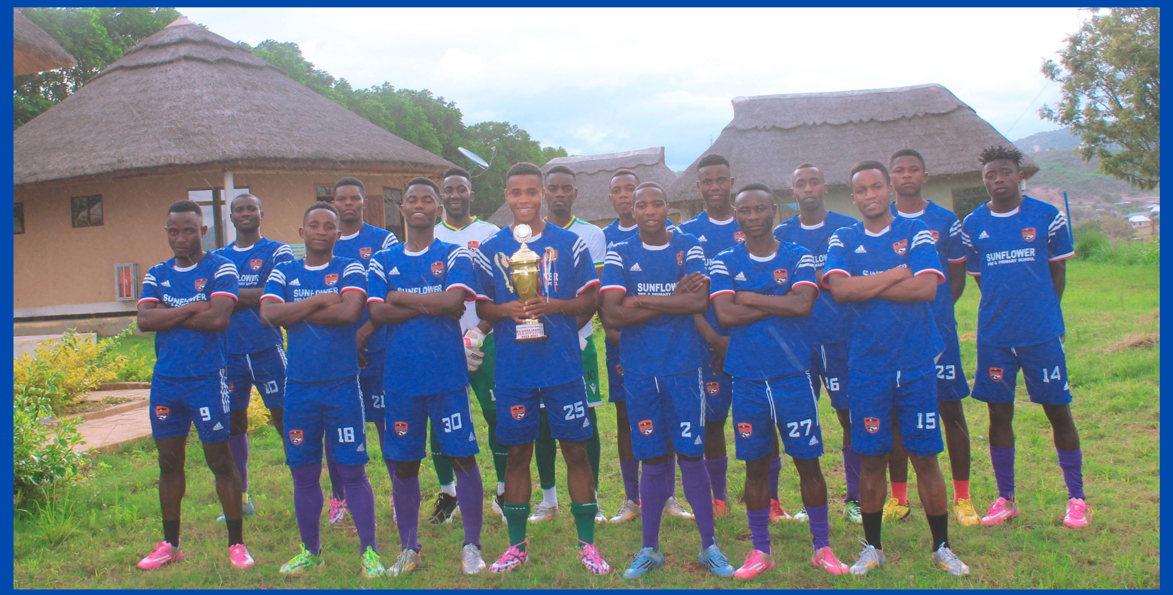
Ilula Tigers Sports Club