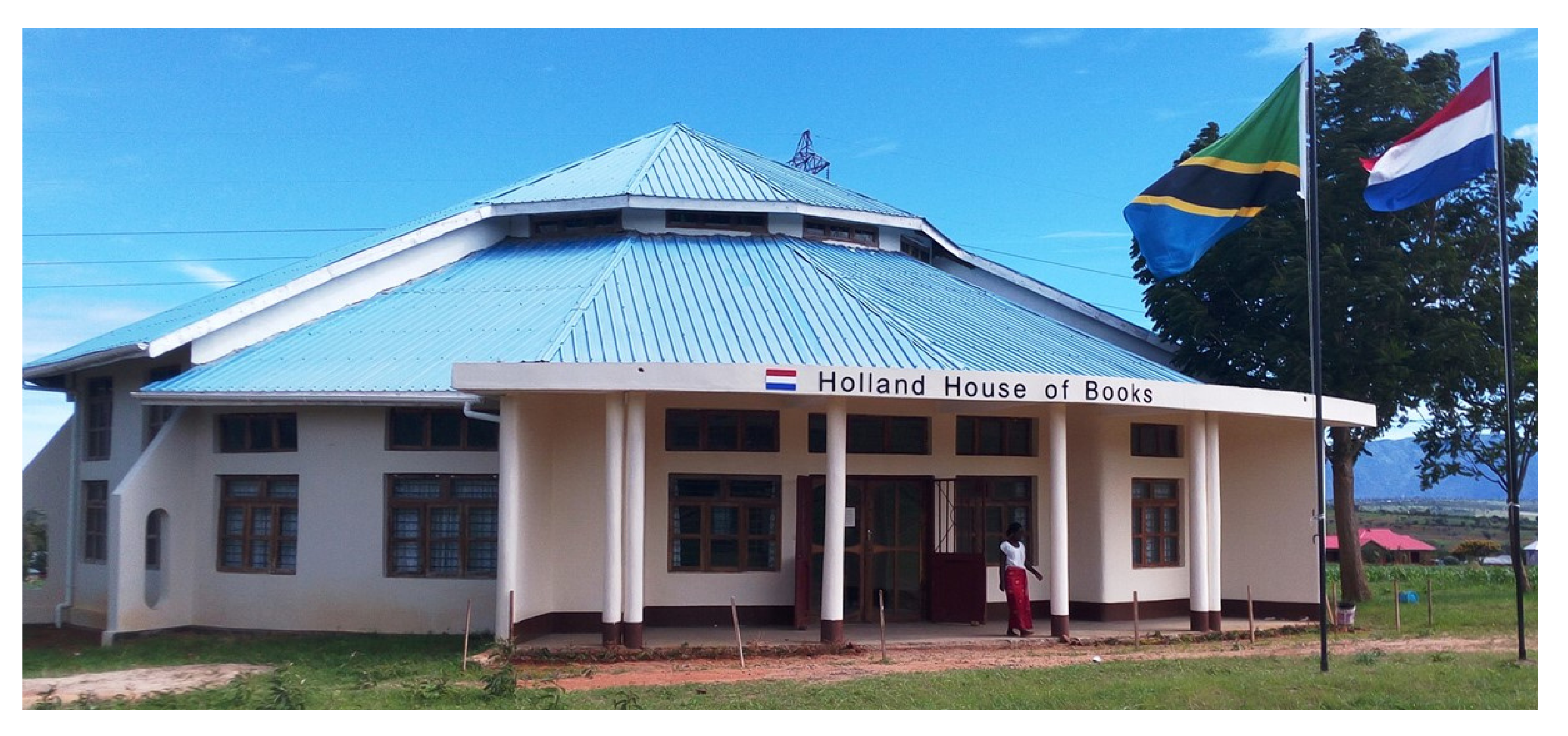
HOLLAND HOUSE OF BOOKS